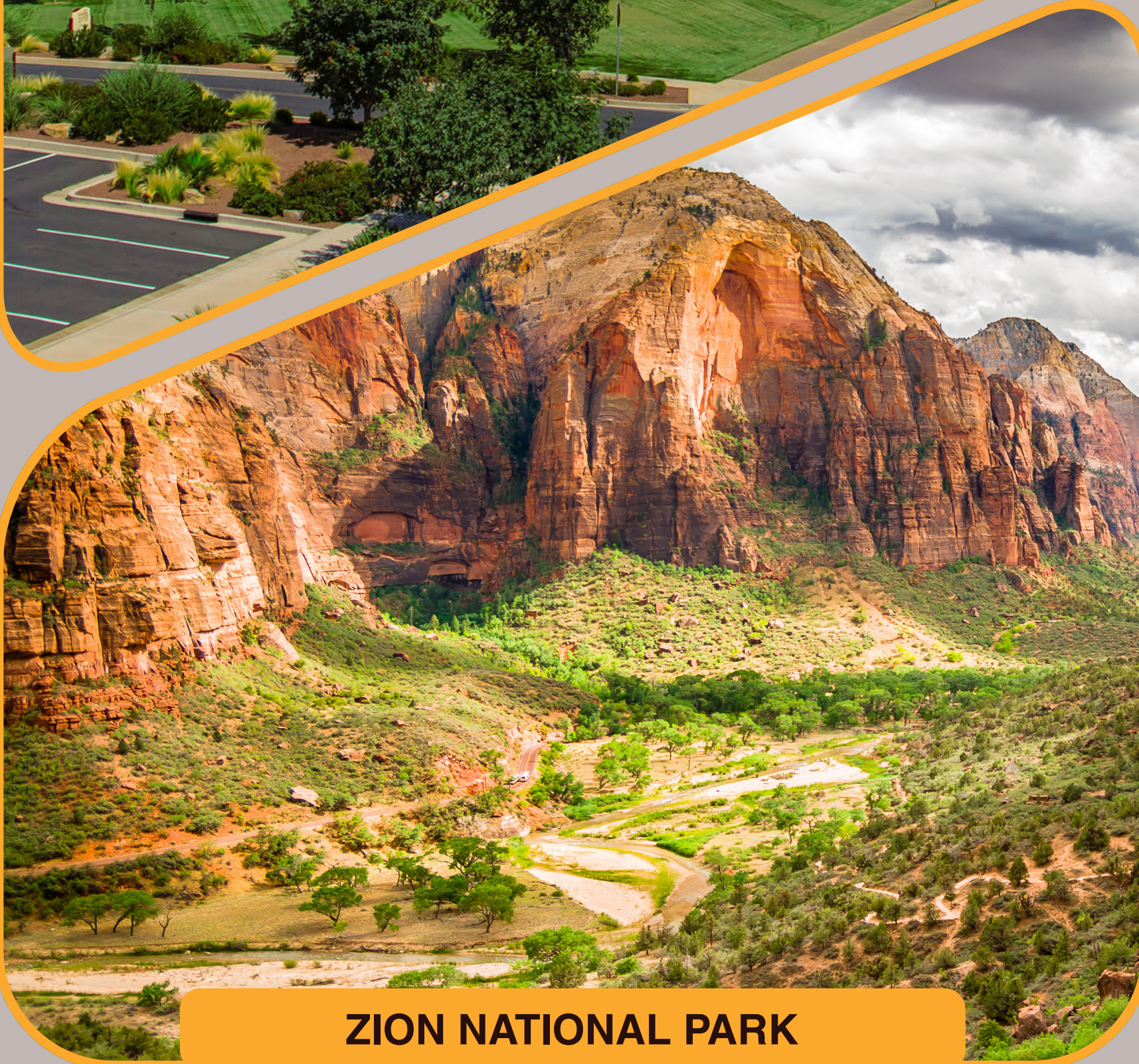
ZION NATIONAL PARK