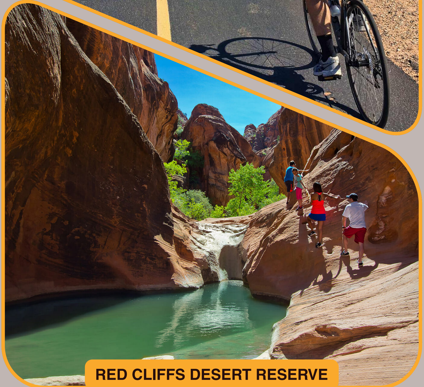
RED CLIFFS DESERT RESERVE