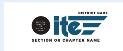
Section Logo – Option B