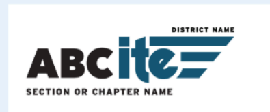
Section Logo – Option C