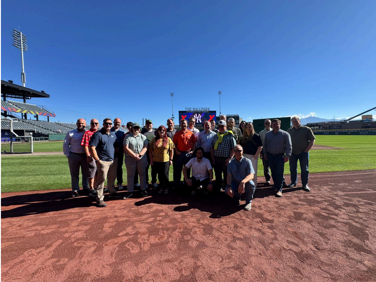
urban core being built in South Jordan.